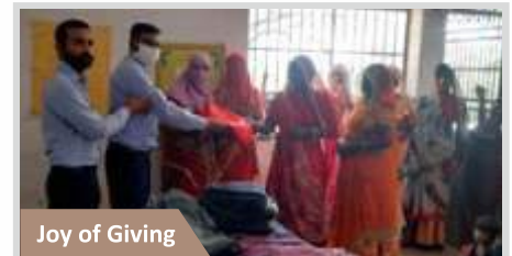
Joy of Giving