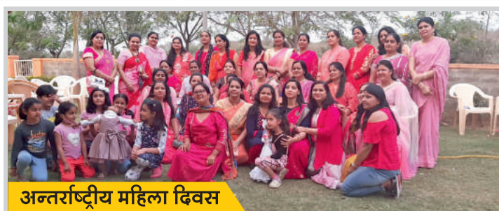
अन्तर्राष्ट्रीय महिला दिवस