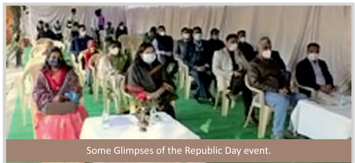
Some Glimpses of the Republic Day event.