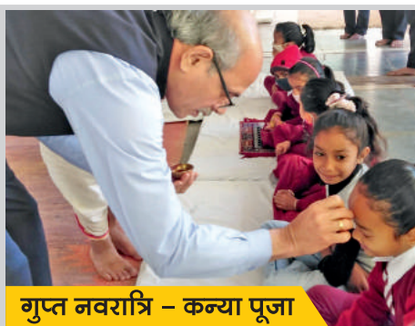
गुप्त नवरात्रि - कन्या पूजा