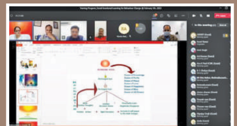
Social Emotional Learning For Behavior Change by Sister Ekta (Bhramkumaris) The training program was attended by total 45 MCS participants including participants from Kalol & Surat Grinding Units.