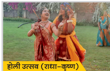
होली उत्सव (राधा-कृष्ण)