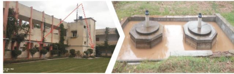
Rain Water harvesting Structure