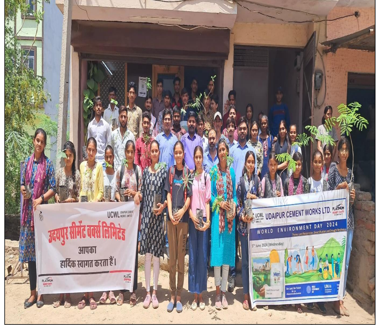
The event was held at Dabok and was open to all students from different classes. The foremost aim of the event is to spread the importance of environment with the help of creativity.