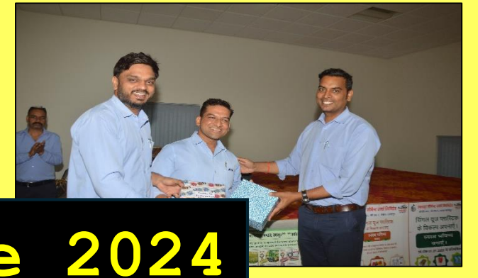
Closing Ceremony-10 June 2024