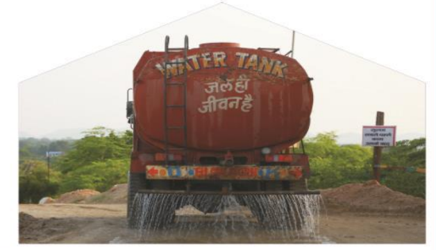
Truck Mounted Water Sprinkler