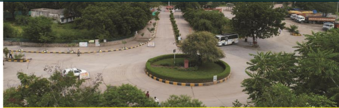
Udaipur Cement Works Limited