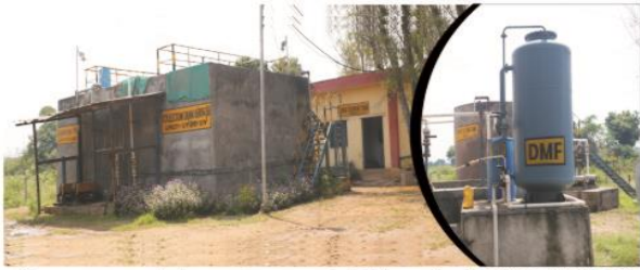
Sewage Treatment Plant (250 KLD)