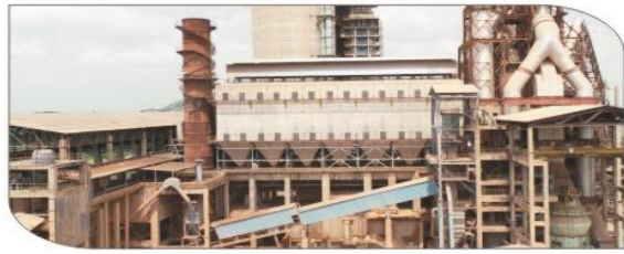
Reverse Air Bag House