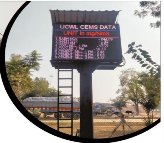
Digital Display Board