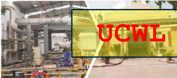
Waste Heat Recovery System