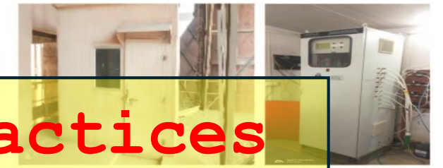
Continuous Emission Monitoring System