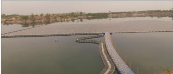
Floating Solar Plant- (1 MW)