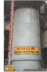
Selective Non Catalytic Reduction