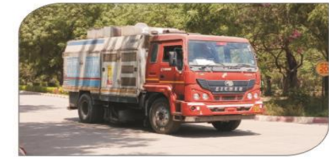
Dust Sweeping Machine